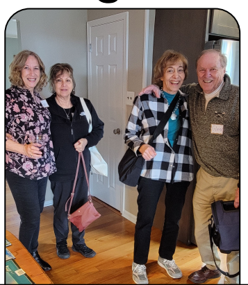
Western Howard County