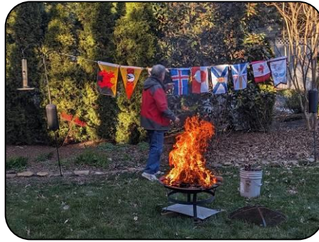
GREAT Fire George!