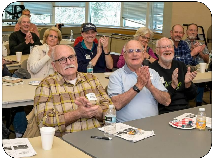
Group of Participants