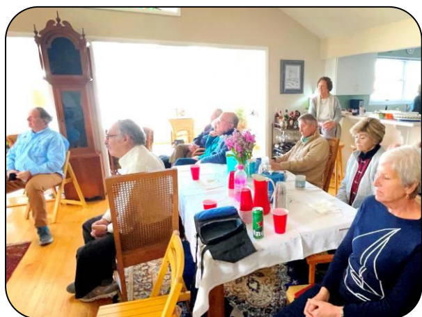
Skipper Participants – submitted by Emil Becker

Photographs submitted by George Hollendursky (Except as noted)