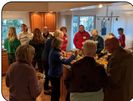
The Food Line