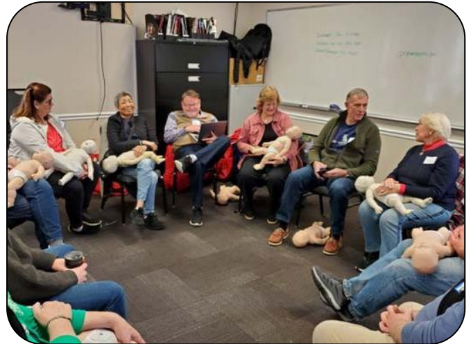
Partial Group of SOS Participants