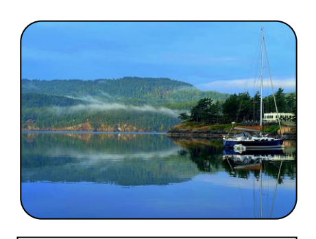
1<sup>st</sup> Place – Destinations Emil Becker