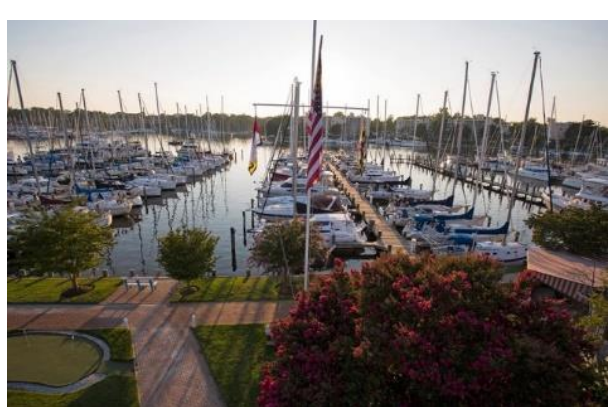
Port Annapolis - Anniversary Party destination