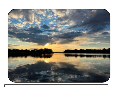
1<sup>st</sup> Place – Bay Scene Cindy Kalkwarf