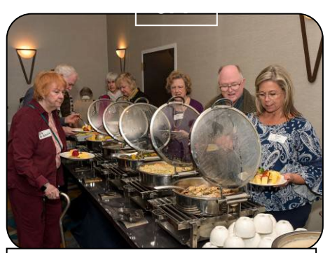
The buffet line.