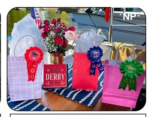
Kentucky Derby Awards