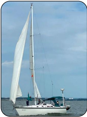
New Skipper Steve Fisher s/v Cloud 9