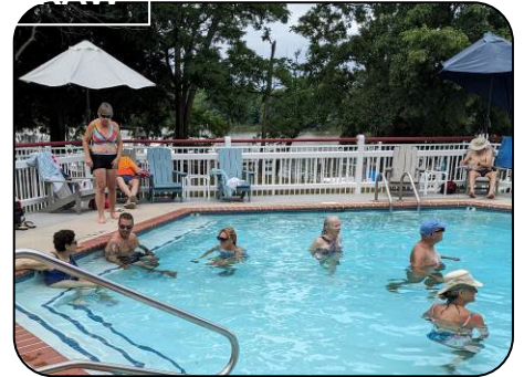
SOS members are cooling off in the pool.