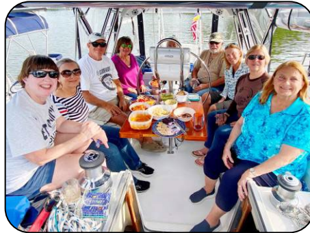
See below 'Top-Center Names'