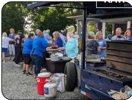
The Food Line