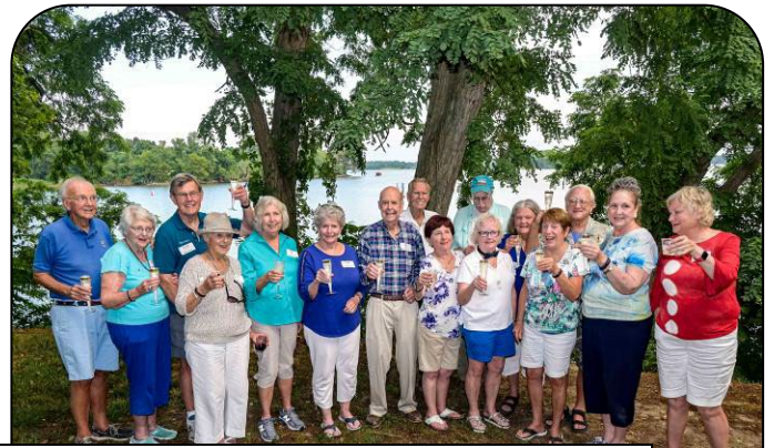
Left Photo: Past Commodores - Right Photo: 30 years or more membership NAMES LISTED BELOW