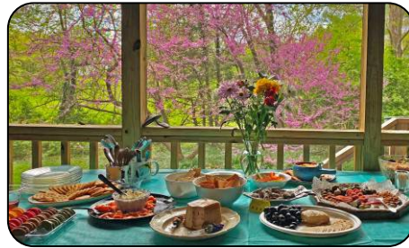
VA backyard gathering at Chilo Obolensky