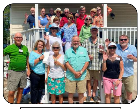
Group Photograph 1