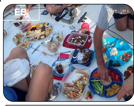
The spread of food.