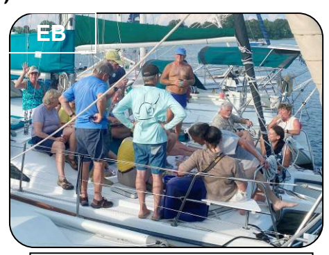
Food Feast on S/v Jazzy Cat