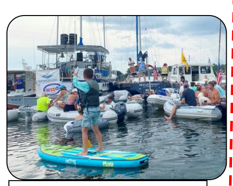
Concert Gathering 1