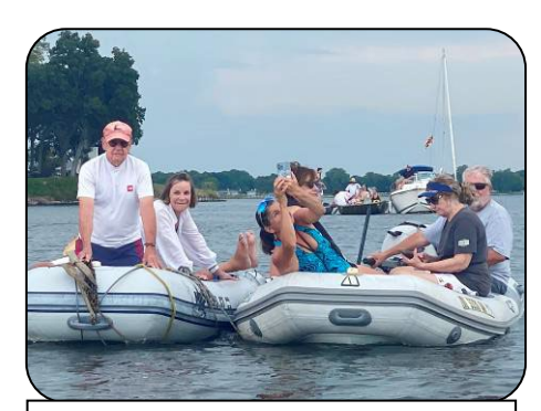
SOS group joining the concert.