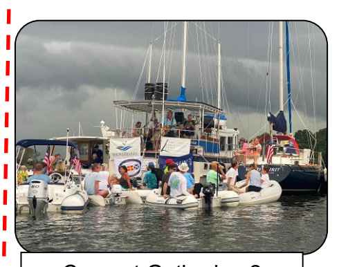
Concert Gathering 2