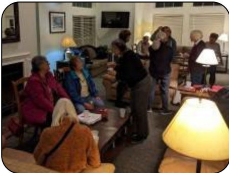
November Board of Directors Meeting