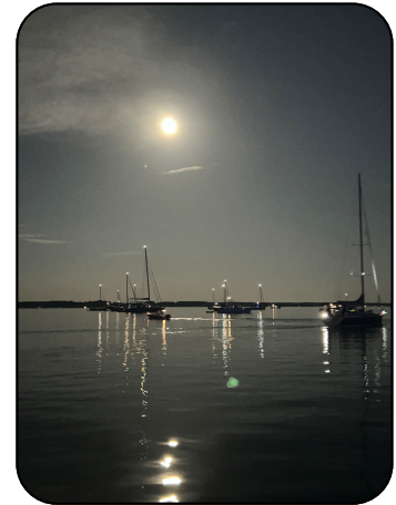
Both photos above are from the OysterFest