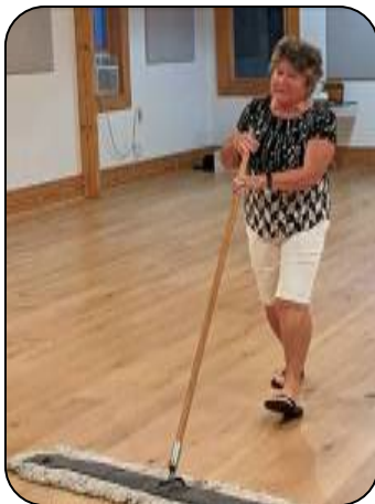
November BOD Meeting