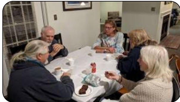
Dinner and casual discussions