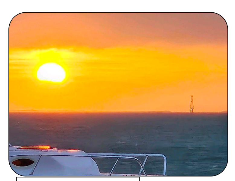
Sunset from the Key West Happy Hour Tiki Cruise