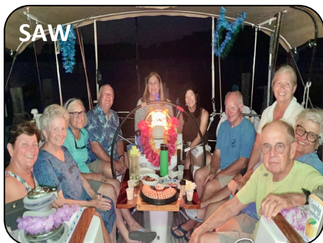
Friday night Hawaiian party theme on board s/v 'Sea Tango'