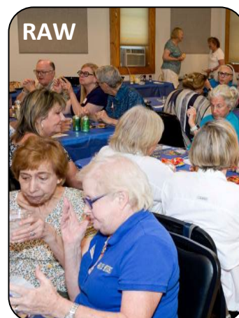
Group Photo at dinner