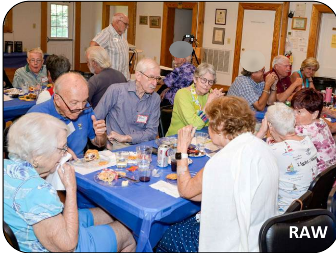
Group Photo at dinner