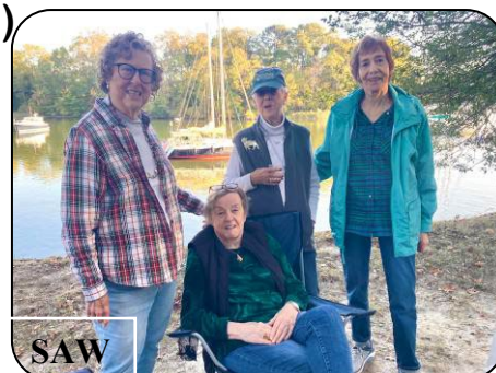
Catching up with longtime friends and making new ones.