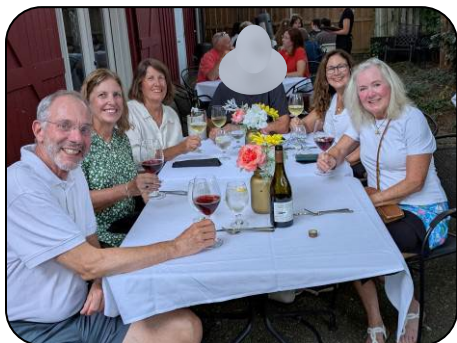
Happy crew has an evening meal together.