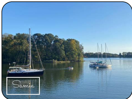
Boats nestled into Granary Creek