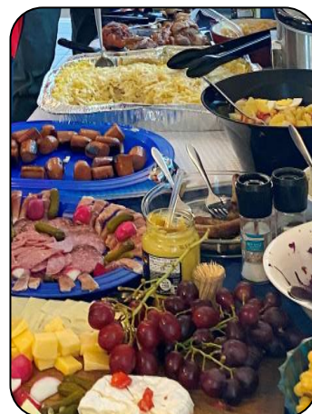
2023 - Food