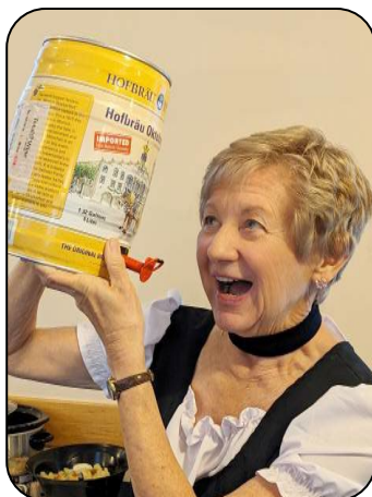
2023 - Susan Absher