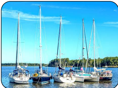
Raft Up - Nose to Toes 08/31/2025