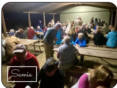
Time to eat, then time to dance.