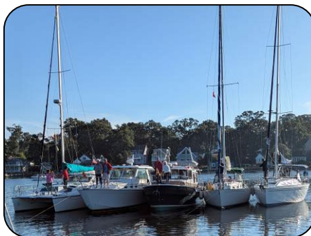
Sept. 1 st Raft-up