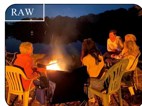
S'mores and relaxation.