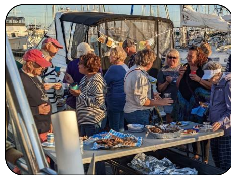
2022 - Food