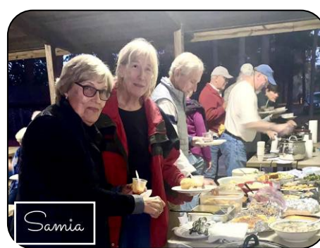
SOS members judging the various chili recipes.