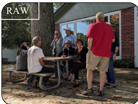
Preparations and setup started early in the day.